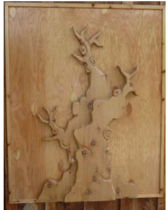
The Nature Center's Giving Tree