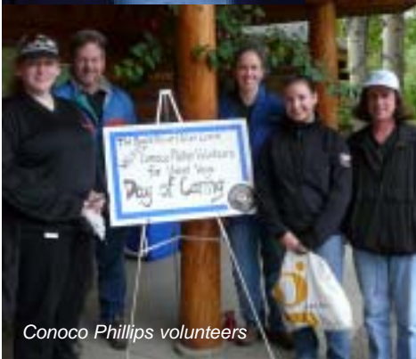
Conoco Phillips volunteers