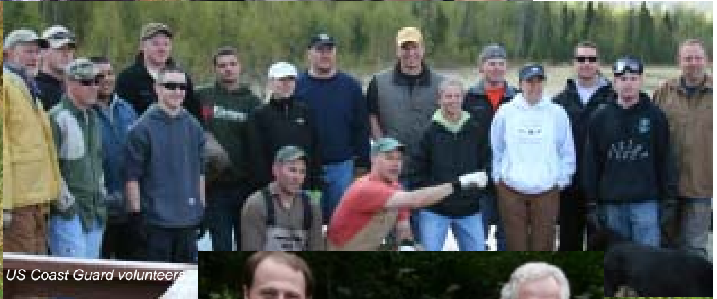
US Coast Guard volunteers