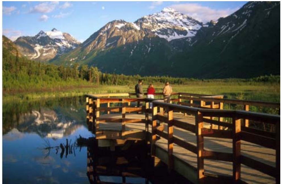
Salmon Viewing Deck along the Rodak Nature Trail.

This trail is a popular destination for self-guided field trips . Allow 4-6 hours round trip.